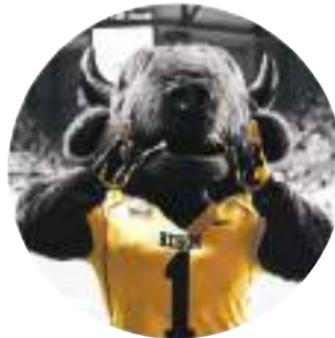
1-Spot: (CMYK) +$60 2-Spot: (Green, Blue, Orange, Red) +$90