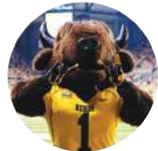
Full Color: +$110